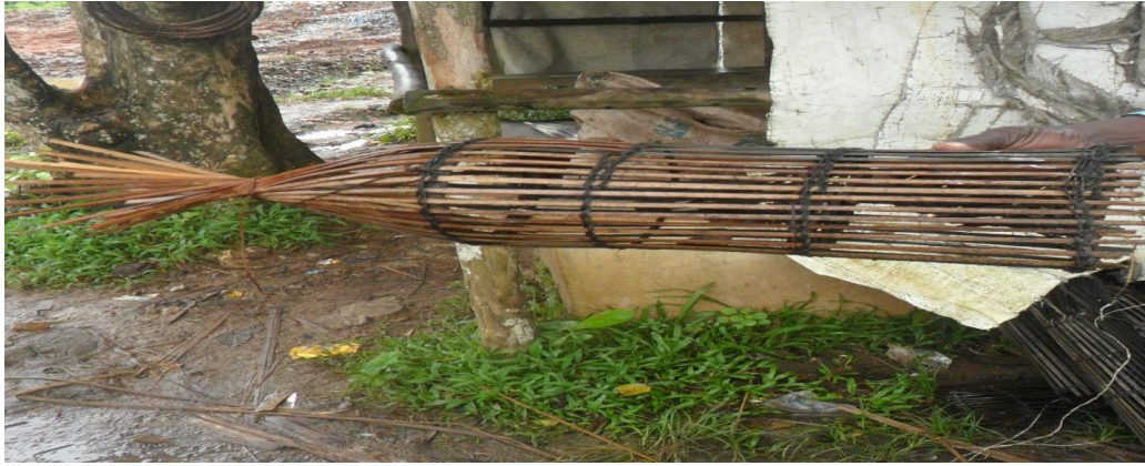
Plate 1: Trap (Igun) used in the collection of the samples