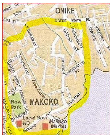
Fig. 1: Map of Yaba Local Government area council showing Makoko

The study area (Makoko) is one of the 43 large blotched slums identified in Lagos (Fig. 1), and has been classified as one of the 9 largest slums in the city. The total area of space coursed by this settlement cannot be easily estimated as residents continue to build and encroach on the water body as population increases (Habitat 2007). Makoko is characterized by adverse environmental condition otherwise known as urban slum (see appendix for Makoko pictures). Below is the Map of Yaba Local Government area council showing Makoko.