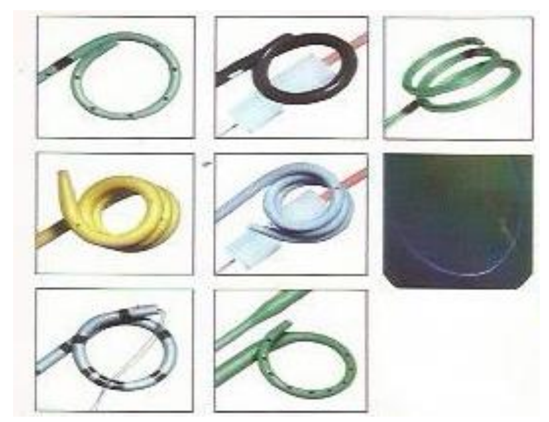
Fig 2: Current Stents Designs (Josh, H. B. 2012)

The aim of this present study is to establish model that will predict male ureteral length. This is a further recommendation of a previous study (Bozzin et al , 2014). The model will be clinically available to select stent prior ureteral stent placement (Janssen et al ; 2012),for male, as shown in fig 2. The link established between physical data and respective ureteral length is an alternative safe procedure to bypass x-ray in double J stent placement (Mannar, 1970;Smedley et al. , 1988; Bebel and Winterkorn, 1993).