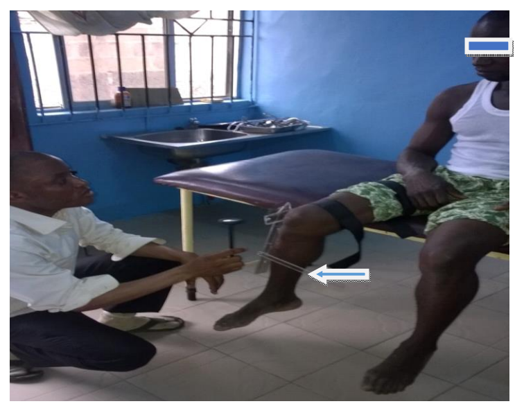
Figure 3: Illustration of the device in use (The Patellar Tendon Tapping to Elicits the Deep Tendon Reflex Response, as measured by the deflection of the perpendicular arm (stud) on the movable arm of the device - as indicated by the arrow).