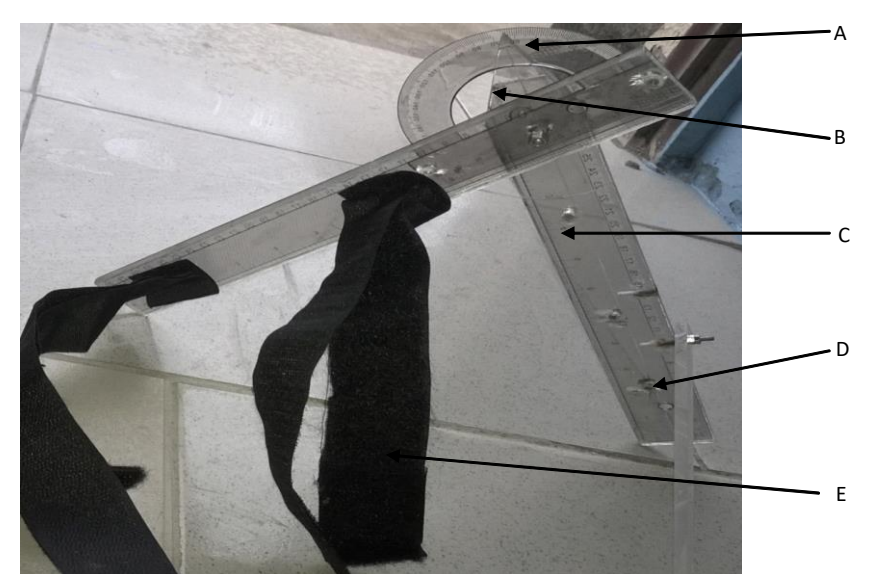
Figure 2: Photograph of the Newly Developed Device (A = the protractor graduated in degrees (the arm); A= the immovable arm (disc); E = the Velcro straps, D = the perpendicular arm (stud) and B = the movable arm).

Figure 1:3D diagram of the Newly Developed Device (made up of a disc graduatedin degrees; the deflecting arm; meter rule, stud and Velcro straps).