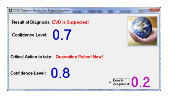
Fig. 4: Results of diagnosis of a contagious EVD case

However in Fig. 4 below a severe condition of EVD was detected and quarantinement was recommended for the patient. The Error in Judgment (EIJ) is further computed by the software to show the degree of its conviction and premise. The EIJ is an optional information source that users or trained personnel can use to further validate the result of the investigation.